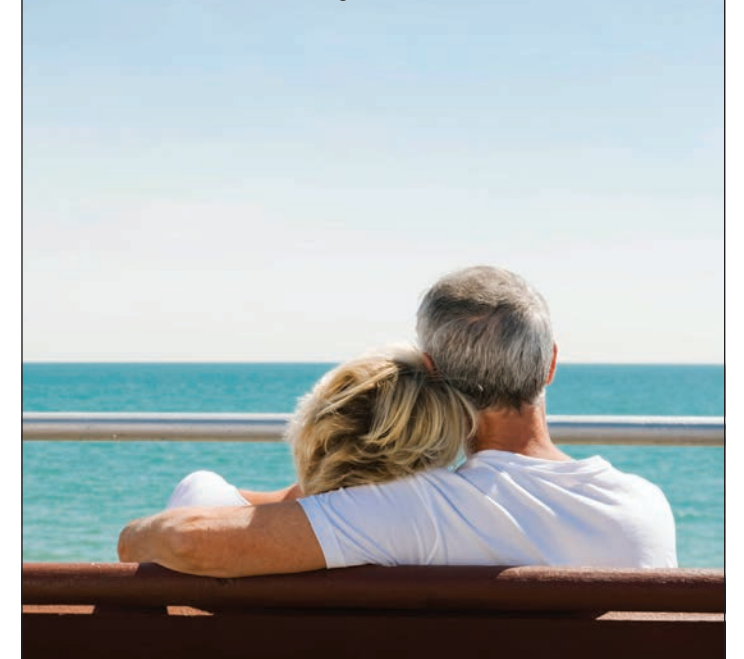
A trust plan may be the answer for you. Come see us today.