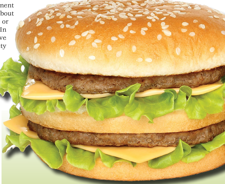
Big Macs around the world

Inflation has caused the median price of a Big Mac in the U.S. to rise by 6% in the last two years, according to the article. Other countries have experienced even more inflation than we have, but the effect has been offset by the changing currency relationships. For example, two years ago the Big Mac was 26% cheaper in Japan, and now it is 41% cheaper.