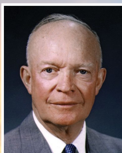
Dwight D. Eisenhower